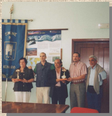
2007 Meteorite Gold award (Secinaro AQ)