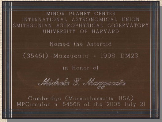
2005 asteroid (35461) Mazzucato