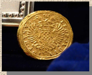
2018 Unghero pepolese d'oro (Castiglione dei P.li BO)