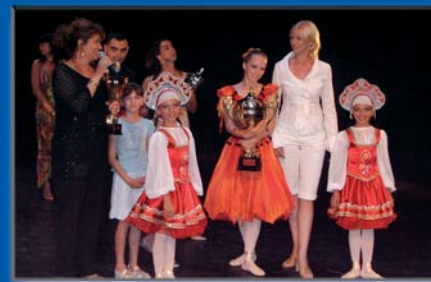
Emotional moments during the Competition

The Jury of the Competition will be composed by international personalities and is the only responsible for awarding. Competitors have no rights of claiming for further rewards not granted by the Jury. If you have any particular "Theatrical requirement" or would like to know the rules of the competition, please don't hesitate to e-mail us: dancegrandprix@dancegrandprix.org and dancegrandprix@tiscali.it