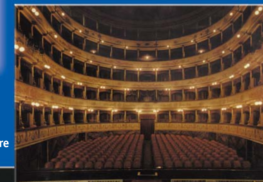
The Festival Theatre

Fanny Elssler, the great "Prima Ballerina" who inaugurated the Festival Theatre in 1846