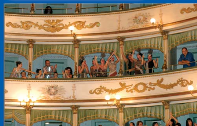
Rudolph Nureyev at the Festival Theatre