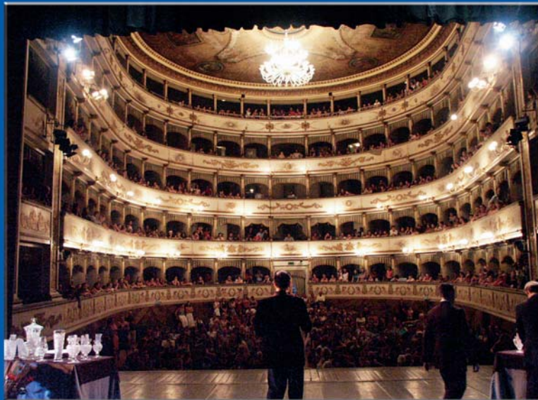
THE THEATRE DURING THE AWARDING CEREMONY

Live your Dance Tournée on the most prestigious Italian Art Cities' Theatres